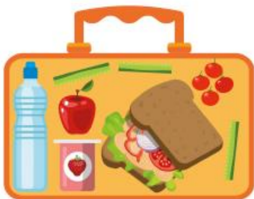
Example of a nutritional packed lunch based on the Eatwell Guide

Choosing nutritional food for a packed lunch can be tricky, especially because processed food and snacks can contain lots of fat and sugar. Choosing a variety of foods from the Eatwell Guide can help to make packed lunches healthier.